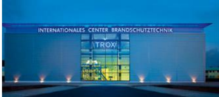
INTERNATIONAL CENTER FOR FIRE PROTECTION AND SMOKE PROTECTION