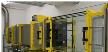
FOR HIGHEST DEMANDS FILTER TECHNOLOGY