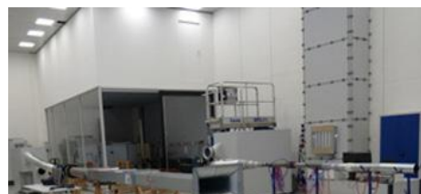
TEST FACILITIES CONTROL TECHNOLOGY