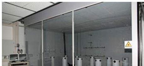
TEST FACILITIES AIR DISTRIBUTION TECHNOLOGY DEMO ROOM