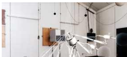
MEASUREMENTS ON SOUND ATTENUATORS ACOUSTICS